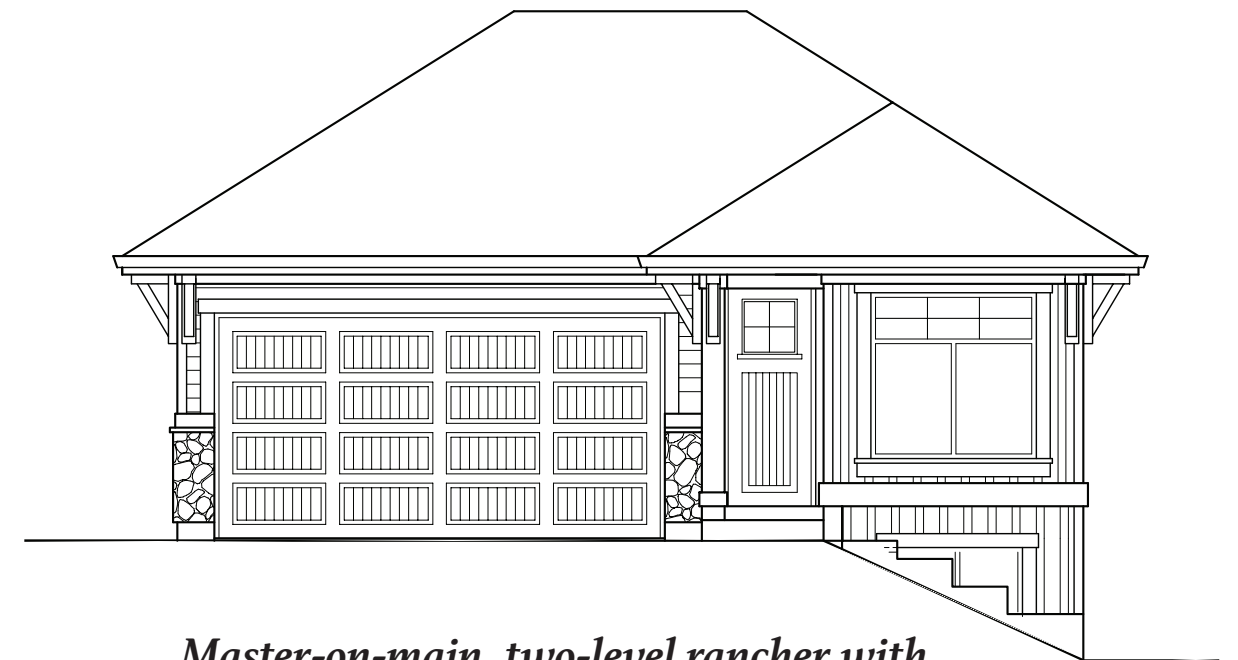
Master-on-main, two-level rancher with walkout basement and optional 2-bdrm suite

Every Sendero Canyon home currently performs at Step 3 efficiency in the Energy Step Code , BC's newest and most stringent home efficiency standard. We're building to tomorrow's standards to ensure your Sendero Canyon investment is solid, and remains high-performing for generations.