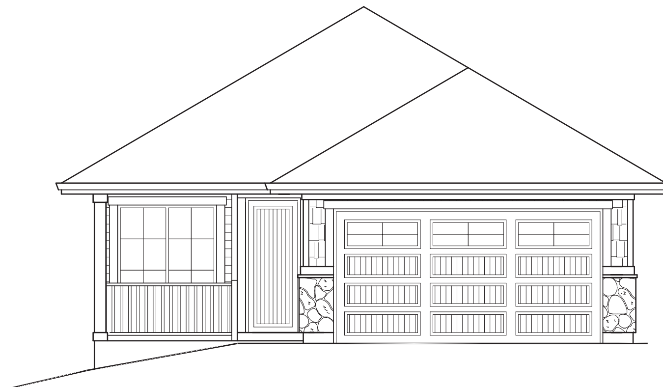
Master-on-main, two-level walk-out rancher fitted with a 2-bedroom secondary suite.

Every Sendero Canyon home currently performs at Step 3 efficiency in the Energy Step Code , BC's newest and most stringent home efficiency standard. We're building to tomorrow's standards to ensure your Sendero Canyon investment is solid, and remains high-performing for generations.