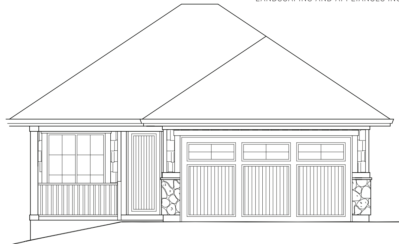
Five bedroom with master-on-main

Every Sendero Canyon home currently performs at Step 3 efficiency in the Energy Step Code , BC's newest and most stringent home efficiency standard. We're building to tomorrow's standards to ensure your Sendero Canyon investment is solid, and remains high-performing for generations.