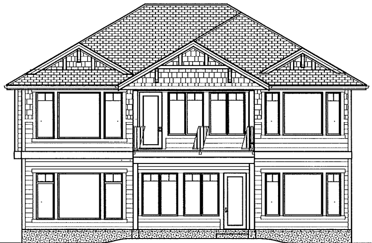
Lot O Sendero Canyon - Front Elevation Holden Road, Penticton, B.C.