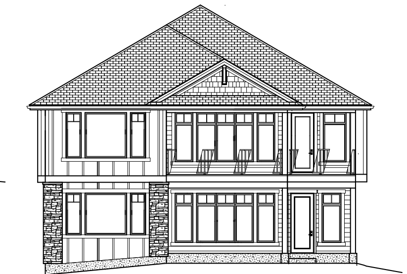
Lot M Sendero Canyon - Front Elevation Holden Road, Penticton, B.C.