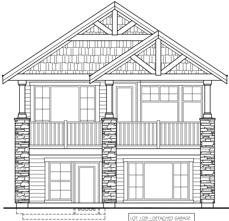
LOT 109 - DETACHED GARAGE LOADED FROM REAR LANE