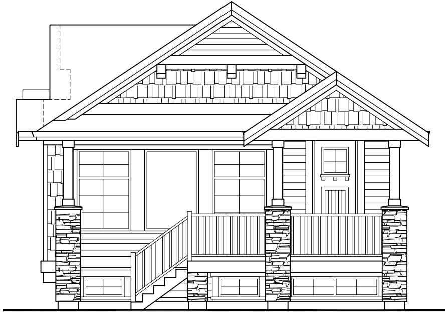
LOT 107 - DETACHED GARAGE LOADED FROM REAR LANE